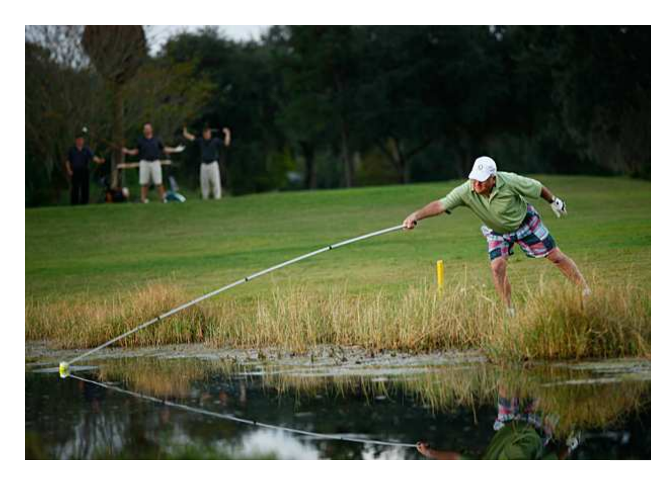
11. Ball Retriever Guy

Defining characteristics: Never passes a water hazard without his trusty scoop at the ready. Last bought a new sleeve of balls in the late 80s. Favorite expression: "Whoa! A ProV1!"